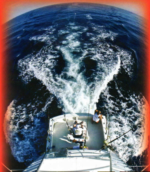
View from Tuna tower of Bite Me 2

The BITE ME departs from Honokohau Harbor, which is the closest destination to the best fishing spot on The Kona Coast, "Grander Alley."